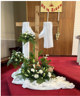
May the blessings of the Risen Lord fill your hearts and homes with peace and joy.