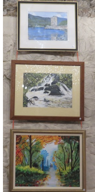
Paintings by Eithne Doyle